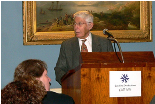
Layalina Counselor and Keynote Speaker Mr. Don Hewitt delivering his remarks at the Union Club.